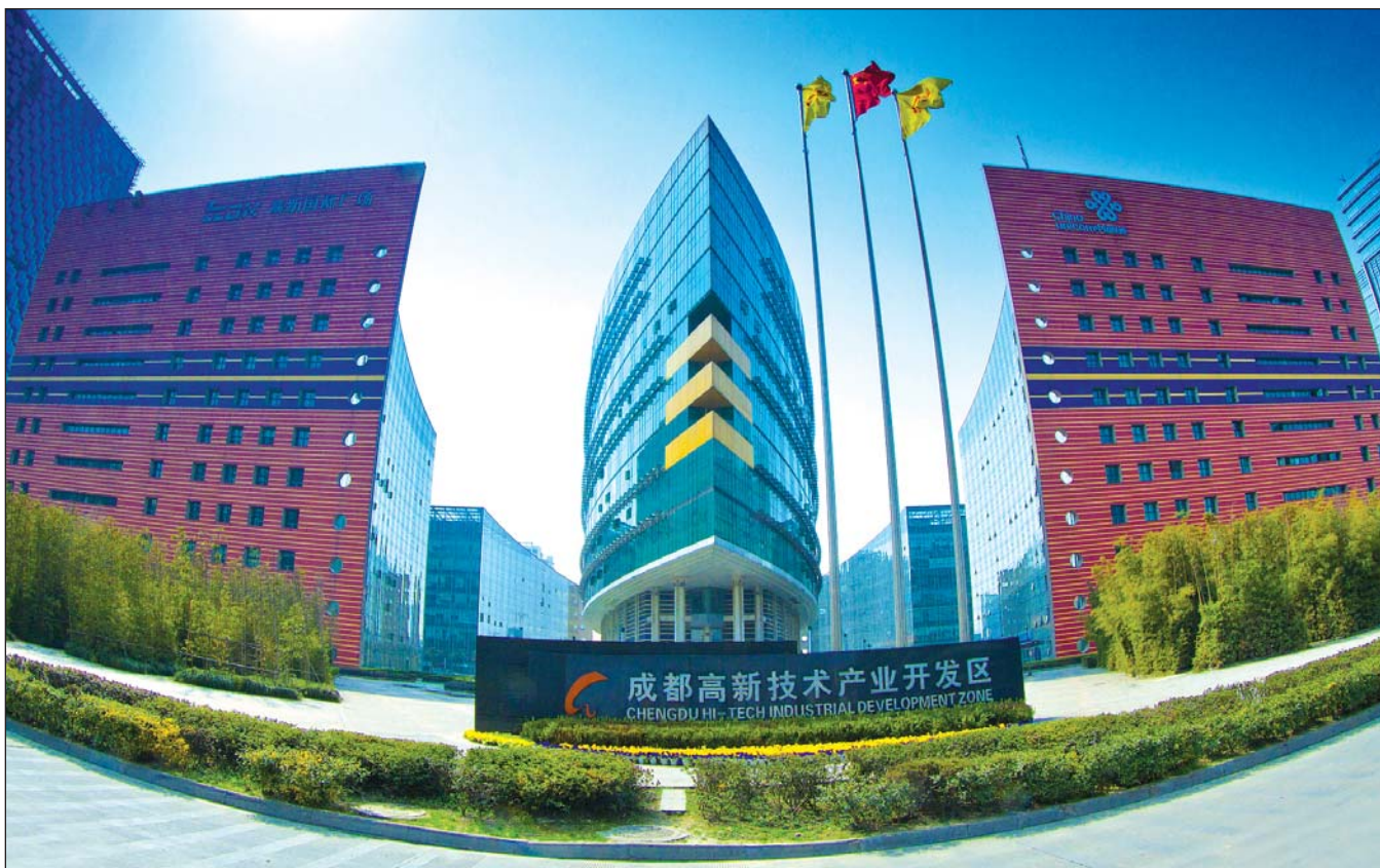
The Chengdu High-tech Zone is one of the earliest State-level high-tech zones in China.

The zone is home to more than 90 percent of the mobile Internet companies in Chengdu.