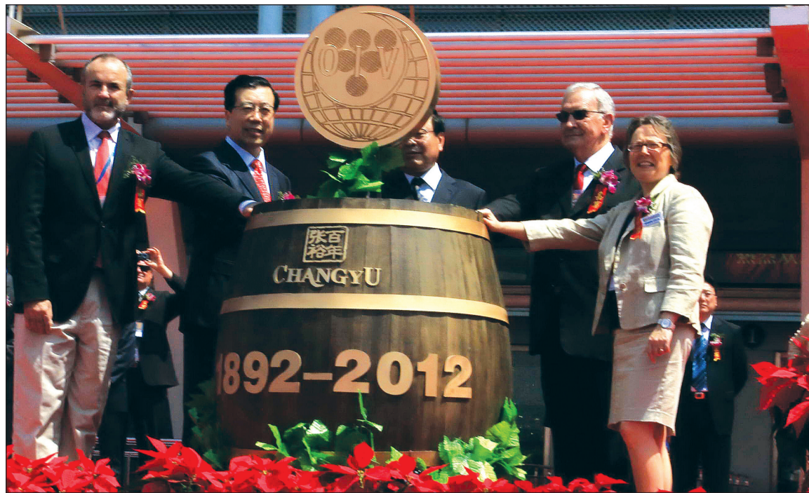
Government officials and international guests attend the opening ceremony.

"Although the wine market in China is fast growing, it still needs time for Chinese to understand wine culture. I hope they can learn to enjoy diverse wines with different food and drink some wine everyday," he said.