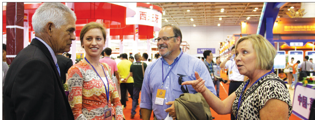
Australian visitors are among the 10,000 participants expected for the event.

The city government also plans to build a wine-themed square and shopping streets to further boost tourism.