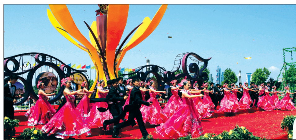
Performances at the on-going exposition.

Sun from the wine association said "10 more chateaus will be built in Yantai by 2015 targeting the high-end wine market and further promoting wine-themed tourism".