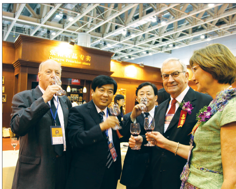
International aficionados taste Changyu wine at the on-going exposition.