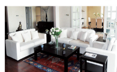
Windsor Avenue # ID: 38759 310sqm 3Br. 3Ba. ¥ 35,000 # high floor, south facing, good view, big balcony