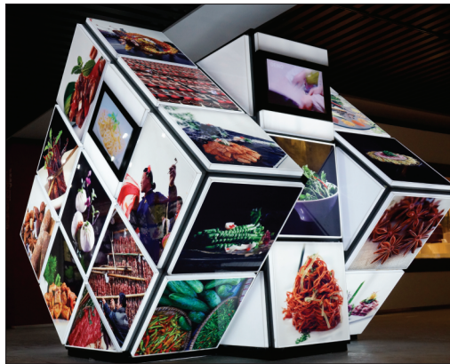
Displays of different types of Sichuan cuisine at the museum.

A highlight of the museum is learning how to make Douban,