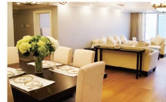
Hairun Int'l Apartment - 海润国际 # ID: 28025 230sqm, 4Br. 3Ba. ¥ 26,000 # high floor, good view, good sunlight