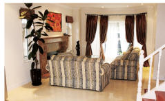
River Garden Villa (B) - 裕京花园 # ID: 07544 300sqm, 4Br. 4Ba. ¥ 38,000 # detached, big garden, open kitchen, good sunlight