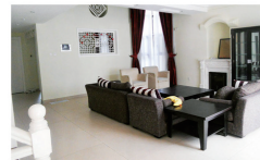
Dragon Bay Villa - 龙湾别墅 # ID: 04065 450sqm, 6Br. 3Ba. ¥ 42,000 # detached, big garden, open kitchen, floor heating