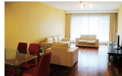
Central Park (II) - 新城国际 # ID: 05073 171sqm, 3Br. 2Ba. ¥ 26,000 # high floor, garden view, value for money