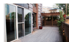
Richmond Park # ID: 40603 250sqm 3Br. 3Ba. ¥ 38,000 # first floor, super large garden, good sunlight