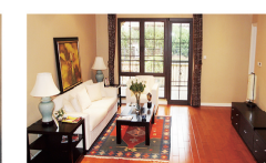
Rose and Ginkgo # ID: 02265 350sqm 4Br. 3Ba. ¥ 38,000 # townhouse, beautiful garden, two kitchens, floor heating

JRE面向业主特推“物业委托服务”。我们不但为业主提供家居装修翻新服务、家具租赁服务、钥匙托管服务及保洁服务，还将保证在三个月内成功出租业主的物业。