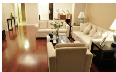
CBD Private Castle - 圣世一品 # ID: 03091 170sqm, 3Br. 2Ba. ¥ 21,000 # penthouse, garden view, good sunlight