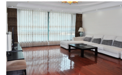
Seasons Park - 海晟名苑 # ID: 03672 250sqm, 4Br. 3Ba. ¥ 36,000 # middle floor, garden view, transversal windows