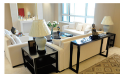
Four Seasons - 四季世家 # ID: 06853 265sqm, 2+1Br. 2Ba. ¥ 40,000 # high floor, garden view, floor heating, value for money