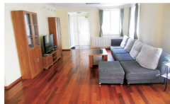
Capital Paradise (I) - 名都园 # ID: 14388 230sqm, 3Br. 2Ba. ¥ 21,000 # semi-detached, beautiful garden, big balcony