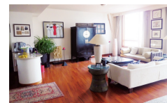
Park Avenue - 公园大道 # ID: 06906 370sqm, 4Br. 3Ba. ¥ 62,000 # middle floor, south facing, garden view, big balcony