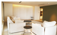
Beijing SOHO Residences - SOHO北京公馆 # ID: 03212 290sqm, 2+1Br. 2Ba. ¥ 35,000 # garden view, good sunlight, value for money