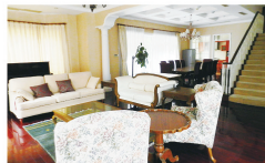
Le Leman Lake Villa (A) - 莱蒙湖 # ID: 08174 682sqm, 4Br. 4Ba. ¥ 53,000 # detached, big garden, value for money