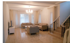
Beijing Riviera (II, E) - 香江花园 # ID: 03718 350sqm, 4Br. 4Ba. ¥ 43,000 # detached, big garden, open kitchen, good sunlight