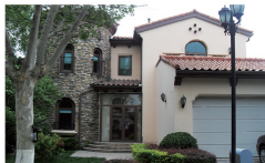
Yosemite (B7) - 优山美地 # ID: 01382 522sqm, 4Br. 5Ba. ¥ 60,000 # corner house, big garden, big balcony, open kitchen