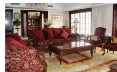
Gentime Int'l Center - 通用国际中心 # ID: 20820 485sqm, 4Br. 3Ba. ¥ 55,000 # high floor, garden view, big balcony