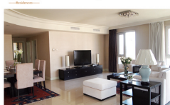
Palm Springs # ID: 10764 190sqm 3Br. 2Ba. ¥ 25,000 # high floor, garden view, arc bay windows