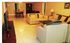
United Apartment - US联邦公寓 # ID: 05151 166sqm, 2Br. 2Ba. ¥ 19,000 # high floor, good view, good sunlight