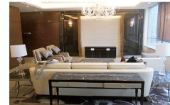
Centrium Residence - 瑞安君汇 # ID: 38731 248sqm, 2+1Br. 2Ba. ¥ 42,000 # high floor, good view, floor heating