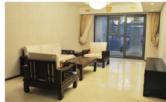
Mixion Residence - 九都汇 # ID: 29666 257sqm, 3Br. 3Ba. ¥ 33,000 # middle floor, south facing, big balcony, floor heating