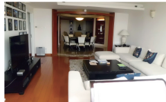
Landmark Palace - 亮马名居 # ID: 04884 300sqm, 2Br. 2Ba. ¥ 43,000 # high floor, south facing, lake view, big terrace