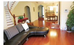
Rose and Ginkgo (I) - 龙湖锦澜山 # ID: 21517 410sqm, 4Br. 3Ba. ¥ 42,000 # corner house, big garden, open kitchen, floor heating