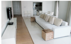
SanlitunSOHO - 三里屯 SOHO # ID: 19645 166sqm, 2+1Br. 2Ba. ¥ 23,000 # middle floor, good view, good sunlight