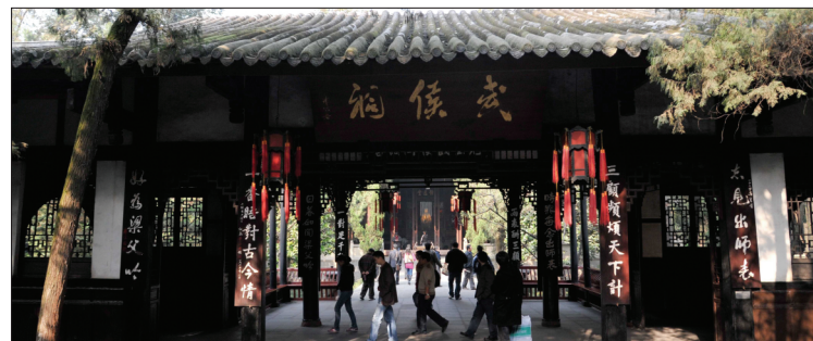
The entrance to the Temple of Marquis Wu.

Sichuan cuisine often contains food preserved through pickling, salting and drying and is generally spicy due to the heavy use of chili oil.